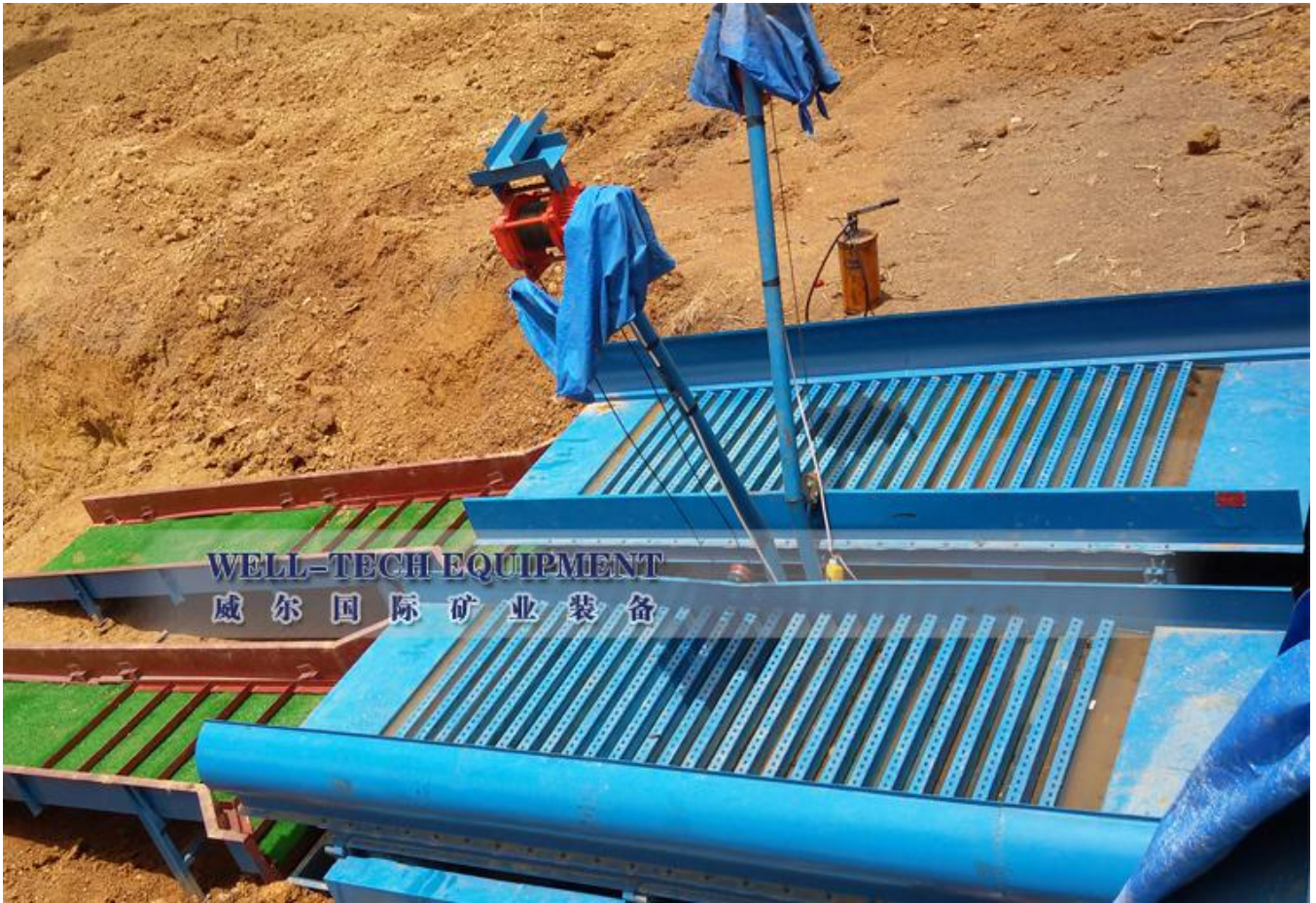
Sluice box near me